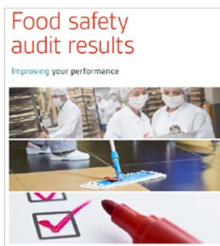
Extract from the BSI whitepaper: Food safety and audit results Improving your performance

These results aren't unique to BSI clients, our list matches the top violations identified by FDA inspectors. In addition to your internal and regular GMP audit programmes, our food safety team used audit data to develop this series of proactive tips to help you identify potential non-conformances.